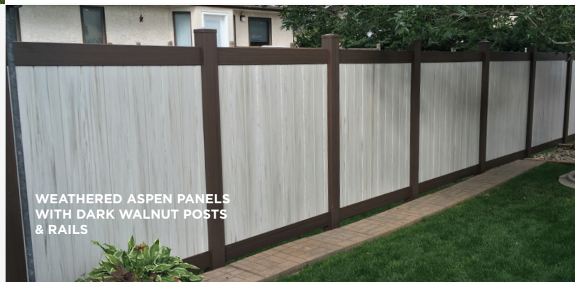
WEATHERED ASPEN PANELS WITH DARK WALNUT POSTS & RAILS

Call your NVP Account Manager for details, availability and pricing.