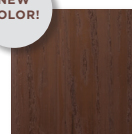
Textured Dark Sequoia